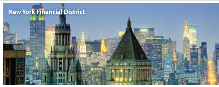
New York Financial District