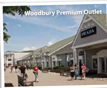
Woodbury Premium Outlet