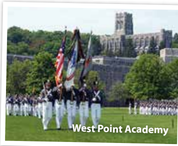
West Point Academy

Drive north to West Point Academy (United States Military Academy), probably the most well-known of all commissioning programs (but the hardest to qualify for) and take a guided tour* to experience the sweep of America's history. Then, spend a few hours at the best and largest premium outlet in the world - Woodbury Premium Outlet to "shop until you drop". Tonight go to New York City and see a Broadway show* - Blue Man, Mamma Mia!, Jersey Boys, Phantom of the Opera or Chicago . Musicals, slapstick and drama have been performed on the Great White Way for decades and you are depriving yourself if you don't take one in.