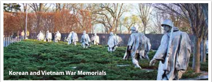
Korean and Vietnam War Memorials