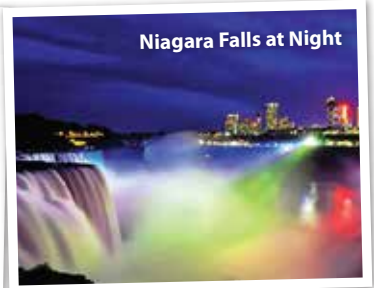
Niagara Falls at Night