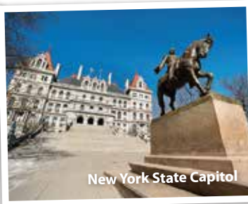
New York State Capitol